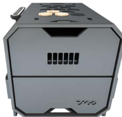
| M1 COOKING