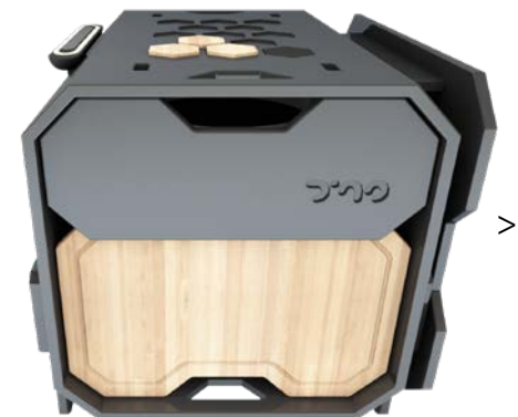
| M2 WATER AND PREPARATION