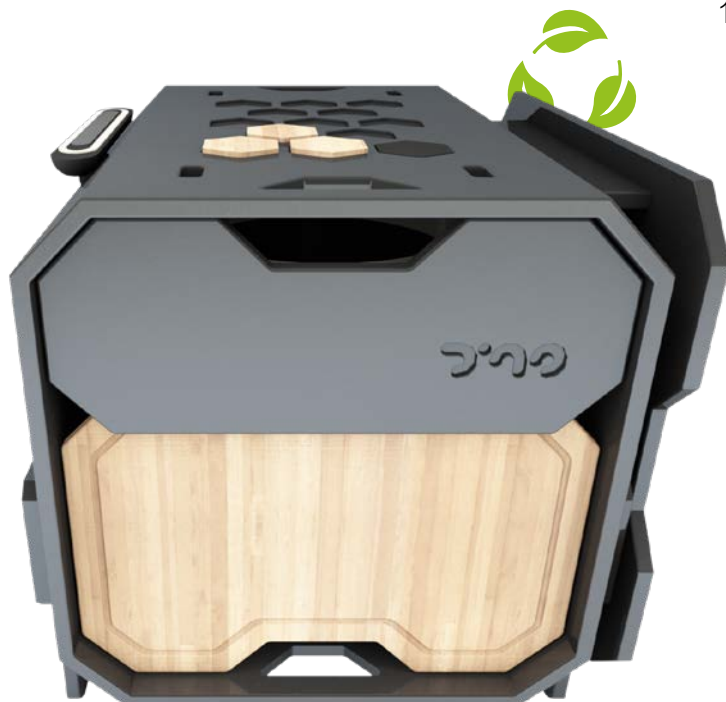
Extendable compartment 0 < 250 mm