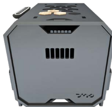
| M3 STORAGE